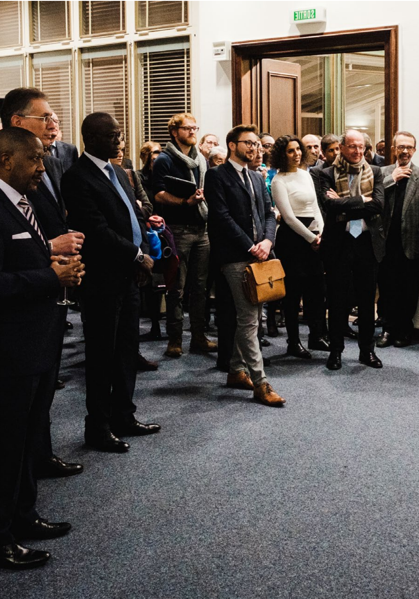
Listening to human right defenders and diplomats