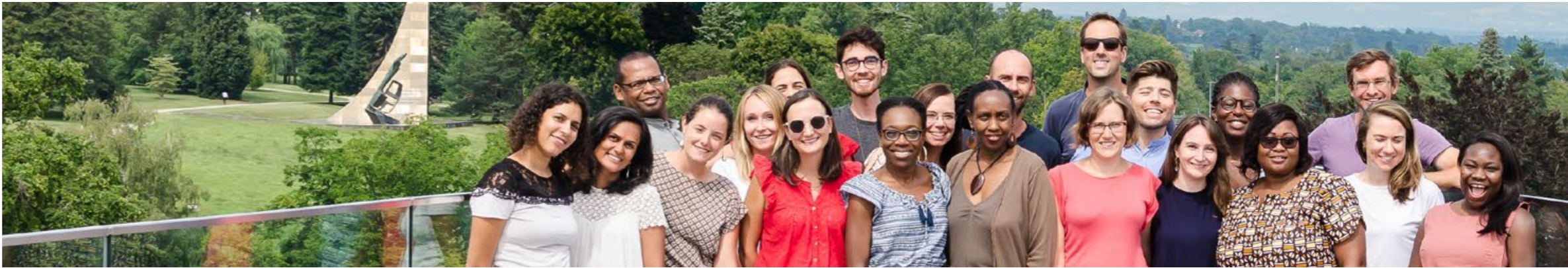
ISHR staff