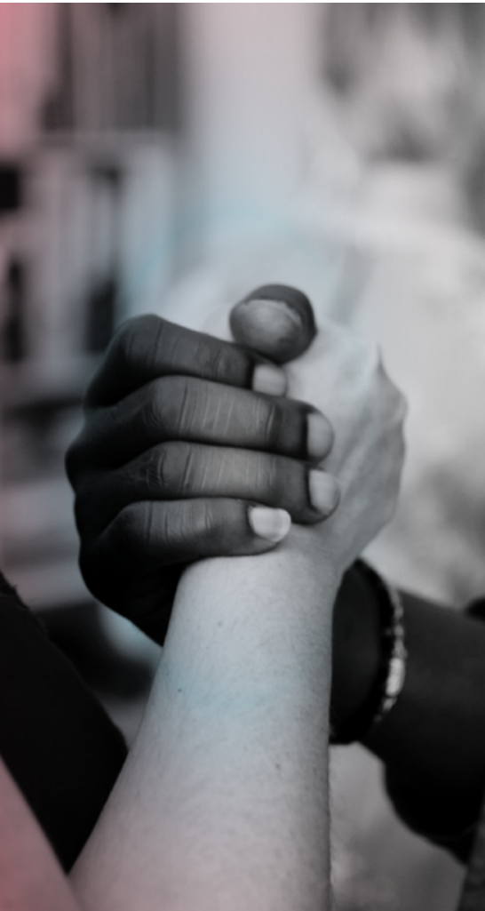
Supporting each other

In accordance with our fundraising strategy, ISHR acquires and prudentially manages the financial resources necessary to flexibly and effectively implement this Strategic Framework, ensure the security, sustainability, agility and effectiveness of the organisation , and establish and maintain a core minimum reserve.