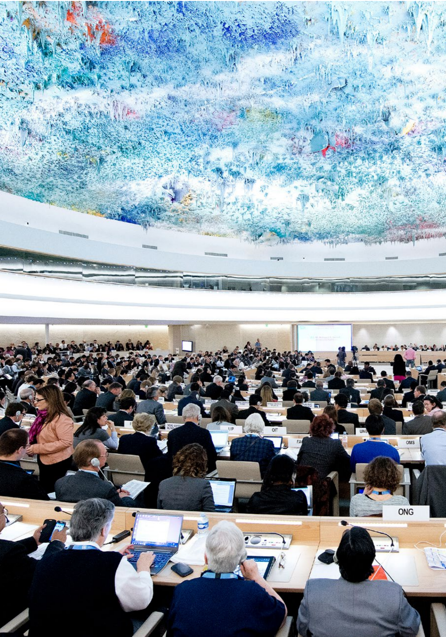
Civil society participation is crucial at the Human Rights Council