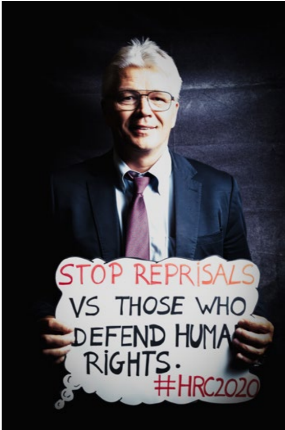
Taking a stance

States respect and protect human rights defenders and fulfil their human rights obligations at the international, regional and national levels, enabling and promoting their work. Businesses and other non-State actors respect human rights and contribute to a safe and enabling environment for defenders where they operate or have influence.