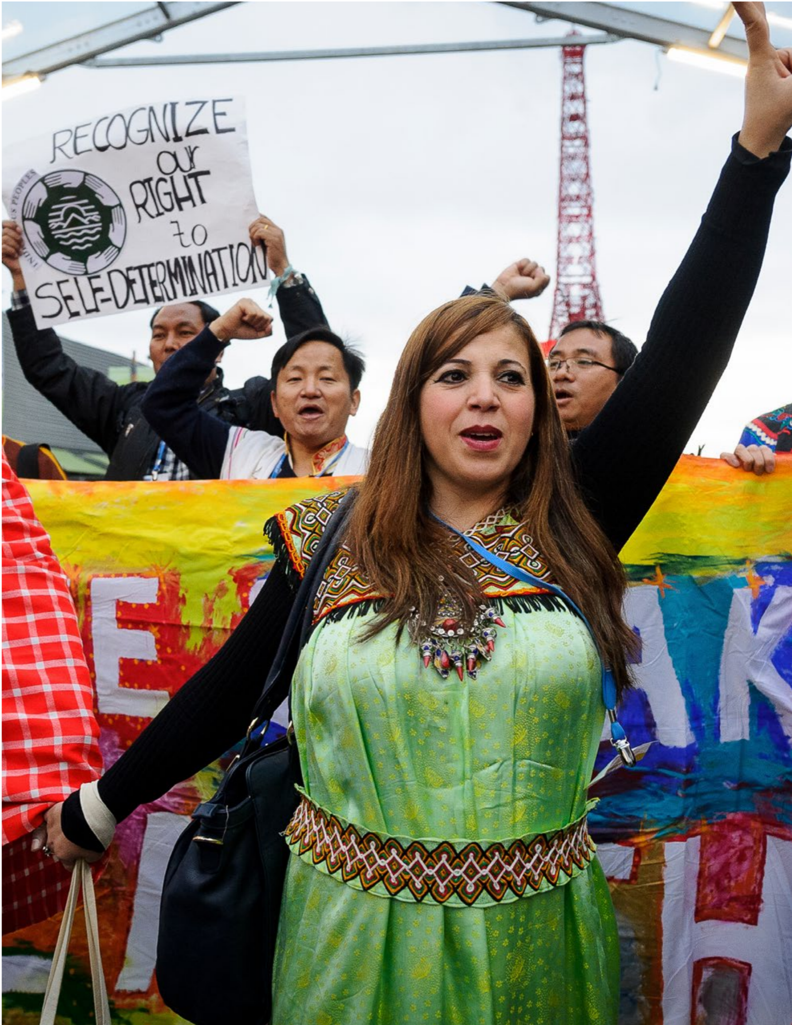
Together we are stronger