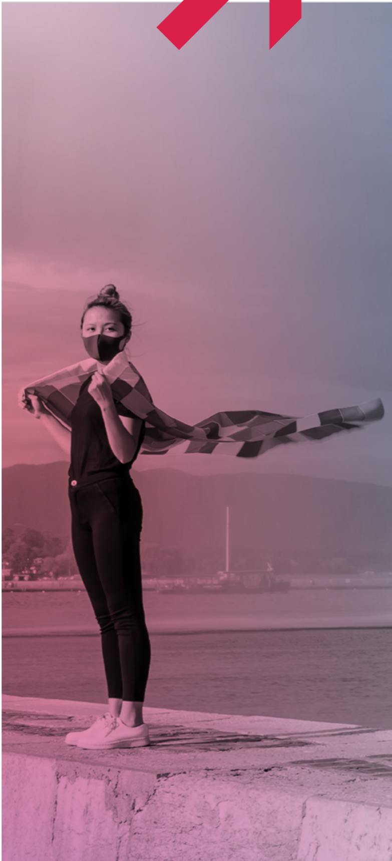
Badiuciao's Lennon Wall flag