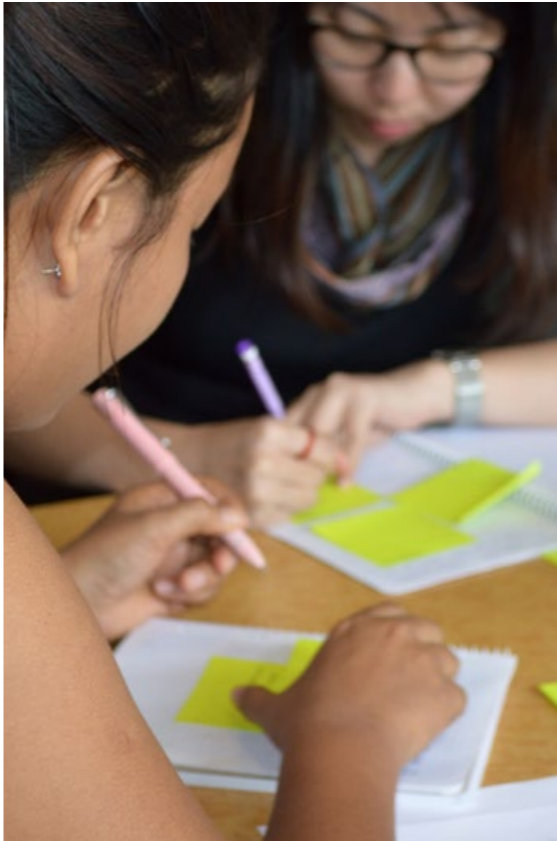
Working together for human rights

Human rights defenders have the tools and networks to be effective and influential in promoting, protecting and contributing to the realisation of human rights.