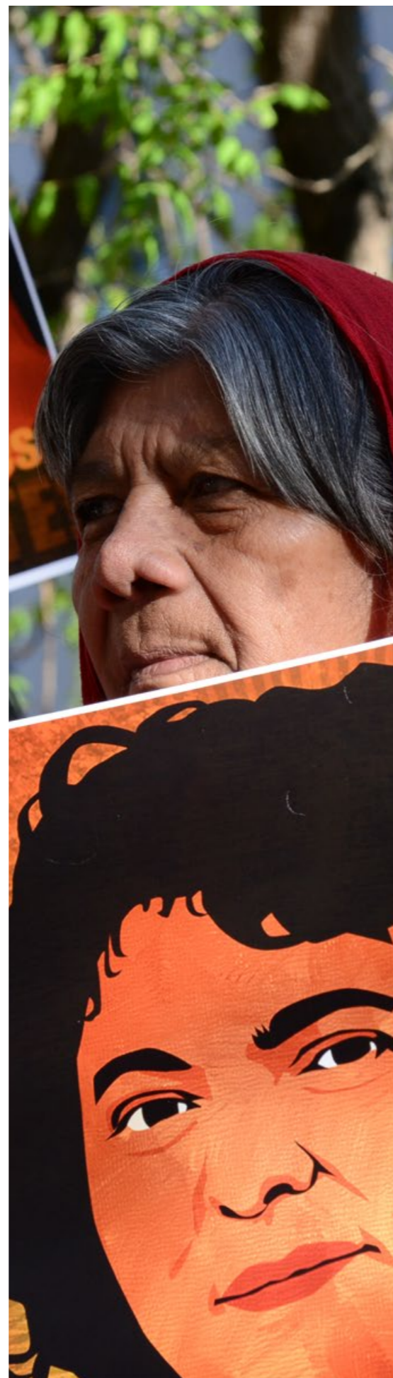
Berta Caceres Protest