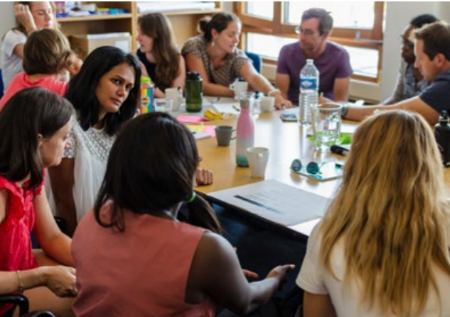
Strategy planning at ISHR